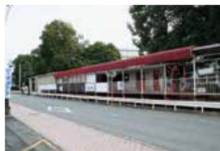
⑤ Tokaigakuen-mae Train Station