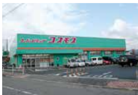
② Drug Store