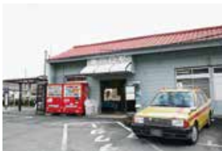
① Tatsudaguchi Train Station