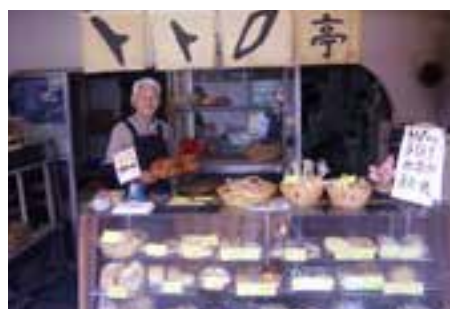
⑥ Kokai Market Street