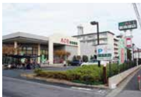
③ Super Market