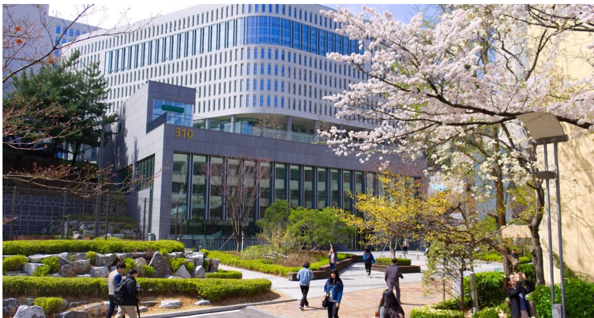
Centennial Building (Bldg. #310)